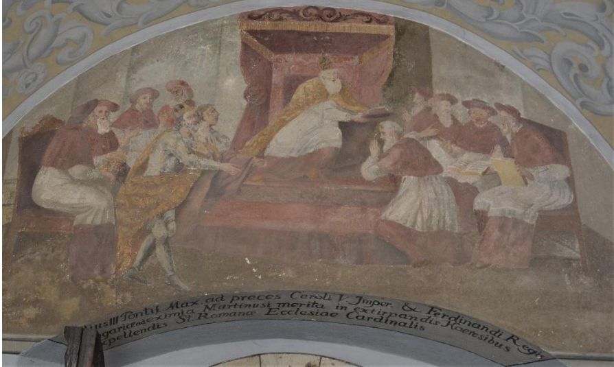
1. Pope Julius III creates George Martinuzzi a cardinal. The painting can be found on the porch of the monastery of Czestochowa. (17 th century)