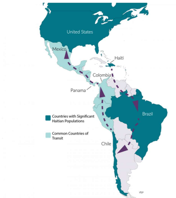
Map 1. Migration patterns and resulting Haitian population in the wider American region.