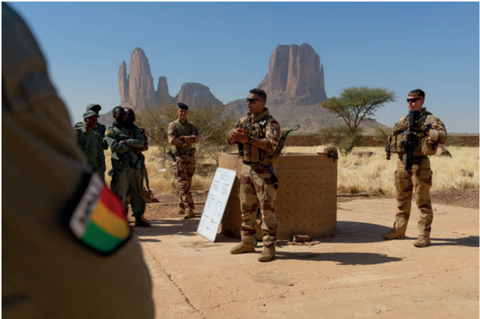
^ Figure 4. Unity in strength: Training of partner armed forces in Mali

Today, the French public opposes the French military presence in the Sahel, and Macron must listen to these voices since elections are coming up in the spring of 2022. For the future, what Macron and the French Ministry of Defense envisage for French foreign engagements could be crucial since Barkhane has been placing huge financial burdens on France. As for the expenses of Barkhane, it cost €695 million in 2019 and nearly €1 billion in 2020, representing 76% of foreign defense spending. The president will have to consider the extent of the French participation if he wants to keep his title as the president of France (Tull, 2021:3; Le Monde, 2021).