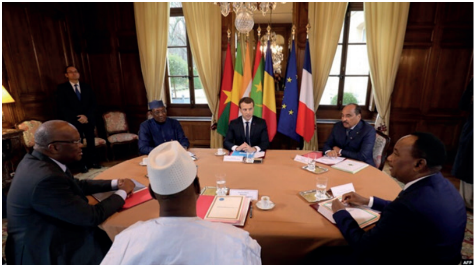
^ Figure 1. French President Emmanuel Macron and the leaders of the G5S in a meeting at Château de la Celle Saint-Cloud in 2017

According to the World Bank’s population estimates of 2019, there are 15 million residents in Chad, 23 million in Niger, 4.5 million in Mauritania, 10 million in Mali, and 20 million in Burkina Faso (World Bank, 2019). In a region where more than half the population lives under the poverty line, these numbers may double by 2050 if the demographic trend does not change soon, which will probably further aggravate the current food security crisis. Surveys conducted by the World Food Program show that more than five million people are starving daily in the Liptako-Gourma region – known as the “tri-border” or “three-borders” zone – which has become one of the most critically affected areas of the Sahel crisis. In the shadow of the pandemic, the health care systems of the conflict-torn region are among the most severely under-