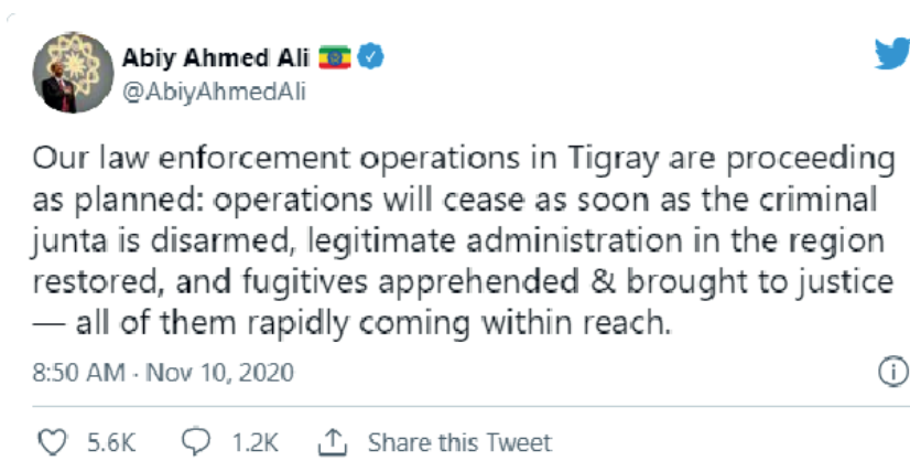
▲ Figure 1. Prime Minister's Twitter post.

After a week had passed, the premier informed the public through his twitter page that the law enforcement was going as planned and would end when the TPLF was disarmed.