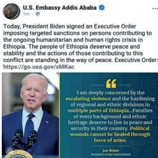
^ Figure 2. U.S. Announcement.

Infrastructure is one of the main enablers for economic growth of African countries. It has a significant contribution to poverty reduction, assuring food security and sustainable development. The role of infrastructure in enhancing the economic growth is mentioned as it is a prerequisite for any development. It is also very difficult to assure sustainable development without proper infrastructures. As it can be seen in the pictures above, schools, health facilities, tourist destinations, and transportation