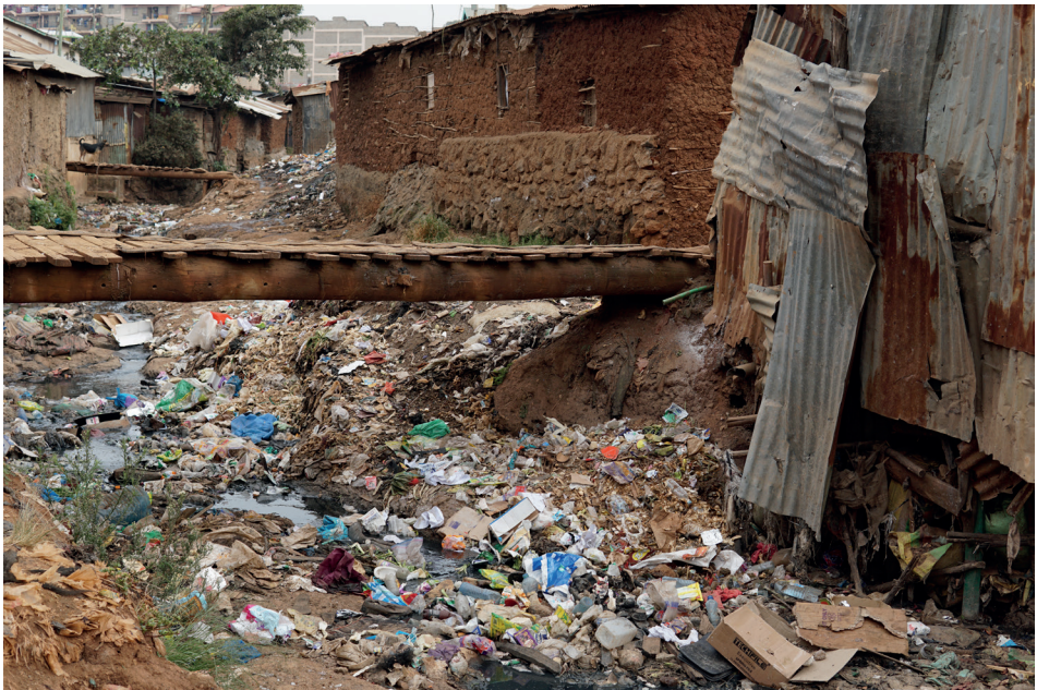
△ Photo 1. Kibera street view in the Kambi muru village.

Article 43 of the constitution of Kenya 2010 recognizes lawful ownership of property and land acquired legally. It explicitly states that the State shall not deprive a person of property of any description and requires prompt payment in full with compensa-