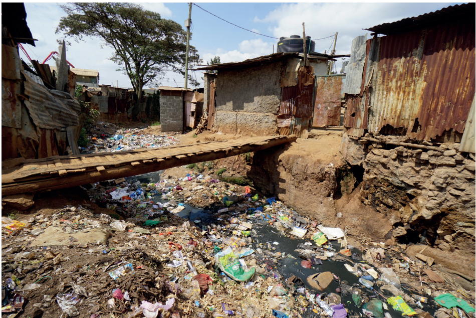
▲ Photo 5. Kibera street view in the Kambi muru village.