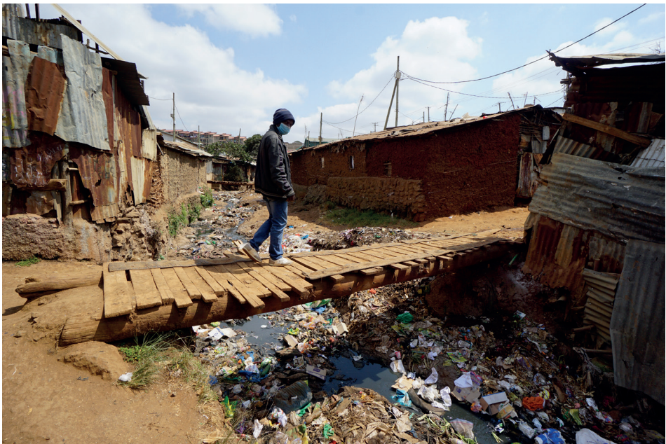
△ Photo 4. Kibera street view in the Kambi muru village.

ICT (2019) outlines that prior to rollout of the resettlement process, information was published in the mainstream media including top-selling newspapers and bulletin boards. Planning of resettlements in various counties was done through a continuous participatory process involving the community, the national and county KISIP teams, the World Bank, and a project consultant. The process included undertaking a social-economic survey, community planning, presentation of base maps, public baraza meetings, verification of beneficiaries, community validation, and land surveying. Jooyato Surveys Limited (2019) indicates that tasks were implemented by various committees, including the Settlement Executive Committee (SEC), the Resettlement Implementation Committee, and the Settlement Grievance Redress Committee. The composition and mandates of the committees varied based on the roles and stage of involvement. The Settlement Executive Committee (SEC) was the main link between community, project team, and government. The resettlement processes were guided by a project specific resettlement framework intended to guide resolution of any displacement anticipated from project activities (ICT, 2019). Provisions within the framework enabled prompt and effective compensation at full replacement cost for loss of assets attributable directly to the project and provided support during the transitional period to enable the affected persons to improve their living standards.