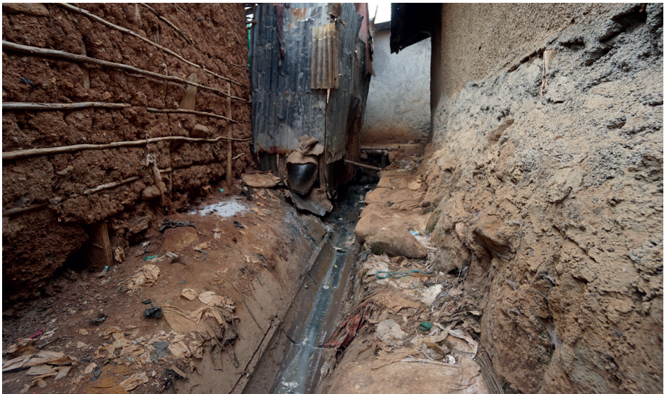
△ Photo 2. The sewage system in Kibera. The area fills with water after a heavy rain.

Although several slum upgrading initiatives have been carried out in Kenya (private or governmental, NGO, or faith-based organizations), this paper focuses on two main projects – KENSUP and KISIP. Anderson and Mwelu (2013) made distinctions between these two projects, stating that the central difference is that KISIP had a short-term (5 years, 2011-2016) scope focused on informal settlements' infrastructure and land tenure in 14 Kenyan counties, while KENSUP is a country-wide, long-term strategy (2005-2025) focusing on housing and related issues. However, during implementation of KISIP, additional funding was sought, which resulted in project being extended to December 2019 (Kamunyori, 2019).