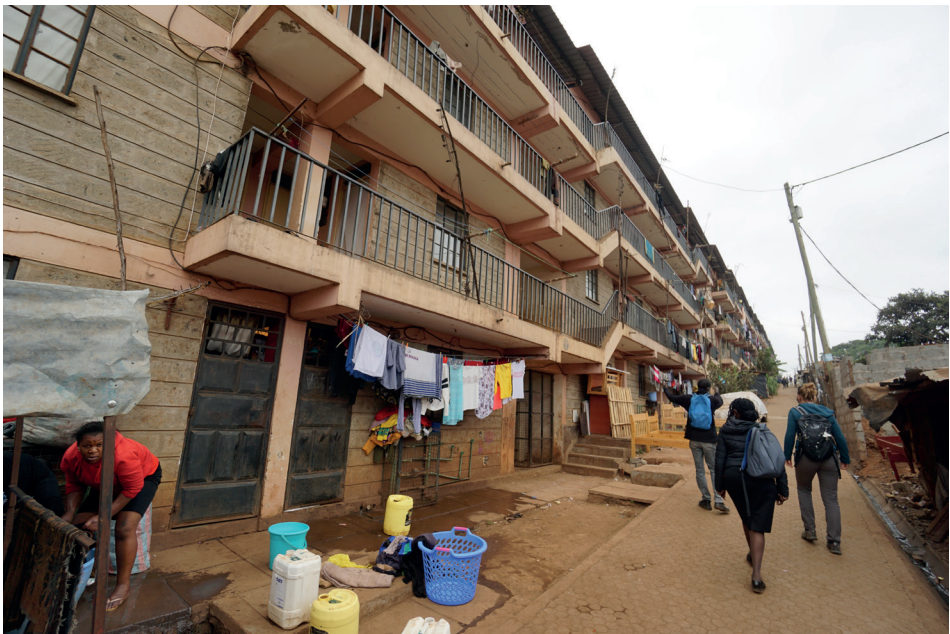
▲ Photo 7. New residential buildings, apartments in Kibera were erected in the frame of the KENSUP project.