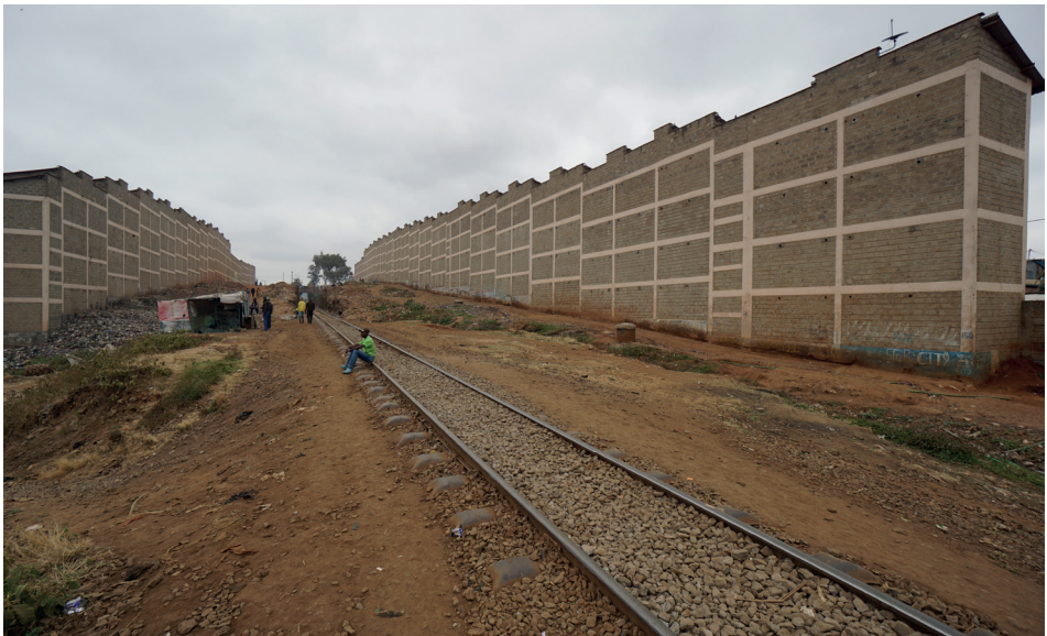
^ Photo 6. New residential buildings, apartments in Kibera were erected in the frame of the KENSUP project.

In line with the partnership priority, a broad-based partnership of the main stakeholders has been formed with an effective project structure bringing together multiple stakeholders. Both KENSUP and KISIP were built on collaboration. KENSUP was established with collaboration between the government and UN-HABITAT, while KISIP was based on a partnership between the government and the World Bank (Andersen and Mwelu, 2013).