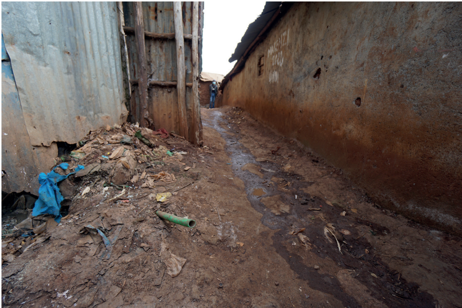
▲ Photo 3. In Kibera illegal cartel-type water vendors get water illegally by cutting through municipal piped networks.

KENSUP was launched during the global observance of World Habitat Day on 4 October 2004. It was designed to demonstrate that the objectives set out in the Habitat Agenda and the Millennium Development Goals, which aimed to improve the lives of slum dwellers, could be achieved in Kenyan towns and cities through interventions promoting a multidisciplinary and integrated approach to slum upgrading (UN-HABITAT, 2007). KENSUP was envisioned to deliver the mandate of upgrading the slum conditions in the target settlements through participatory planning, and it placed communication at its core. However, the extent to which this has been realized will be discussed later in this study (KENSUP, 2016). The project had three levels of coordination and implementation: national, municipality/county, and community (KENSUP, 2016). The national level was comprised of the project secretariat; the municipality/county level was tasked with programme implementation with the community to achieve the intended results; the community level was comprised of a committee known as Settlement Executive Committee (SEC) (KENSUP, 2016). According to Amnesty International (2009), the SEC was comprised of two representatives of community-based organizations – one Non-Governmental Organizations (NGO) representative; two representatives of faith-based organizations; five tenants; two property owners; representatives for people with disabilities; widows; and the local Chief and District Officers.