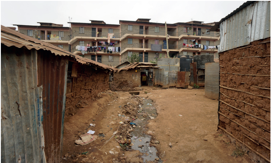
^ Photo 8. New residential buildings, apartments in Kibera were erected in the frame of the KEN-SUP project and the old ones in the foreground of the picture.

The land tenure systems in Kibera are very complex. The Department of Slum Upgrading admits that many court cases filed by property owners regarding tenure have hindered their activities, especially in the Soweto East village in Kibera. Such cases take a long time to solve and sometimes bring slum upgrading initiatives to a standstill (Obare, 2020). ☀