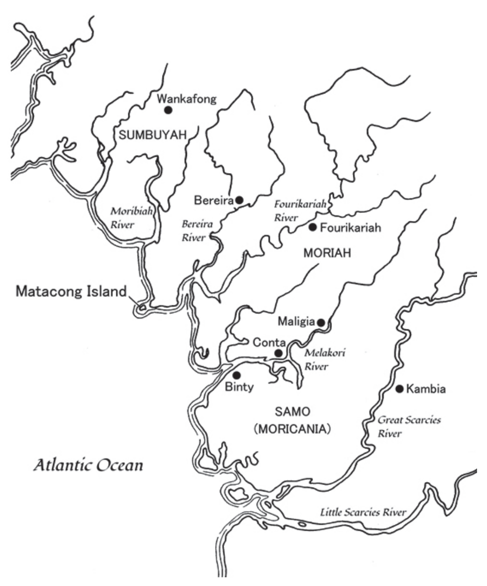
Map 2: Chiefdoms in the Matacong Island Region.

their migration, while also continuously clashing with the various groups belonging to speakers of the Atlantic languages who already lived in the region. As a result, by no later than the 18<sup>th</sup> century, they had come to inhabit a broad region of coastline, stretching from the northern bank of the Pongas River in the north to the vicinity of the Great Scarcies River in the south.